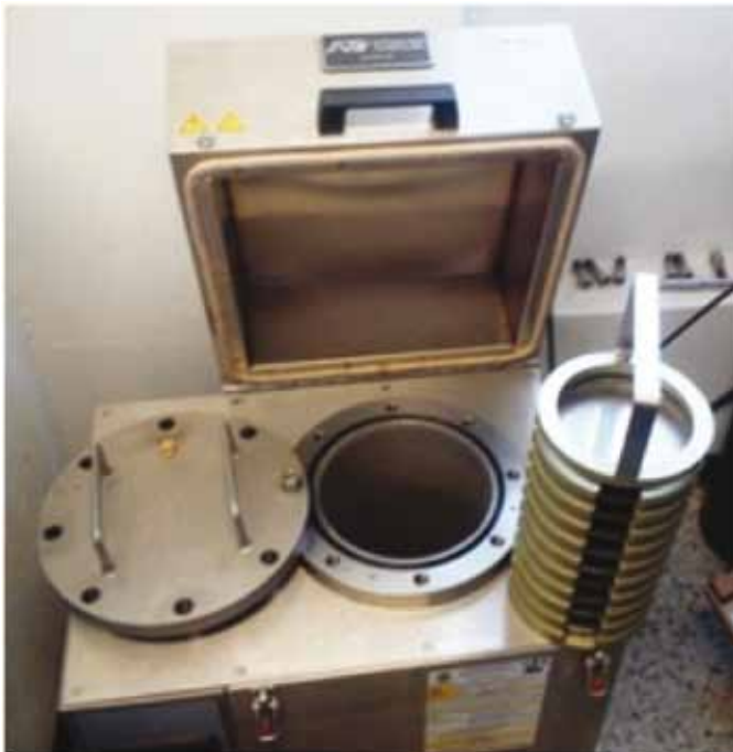
Figure 1. Pressure asphalt vessel and tray holder