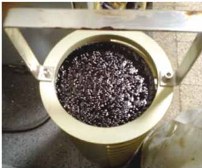
Figure 3. Ledge with aged asphalt