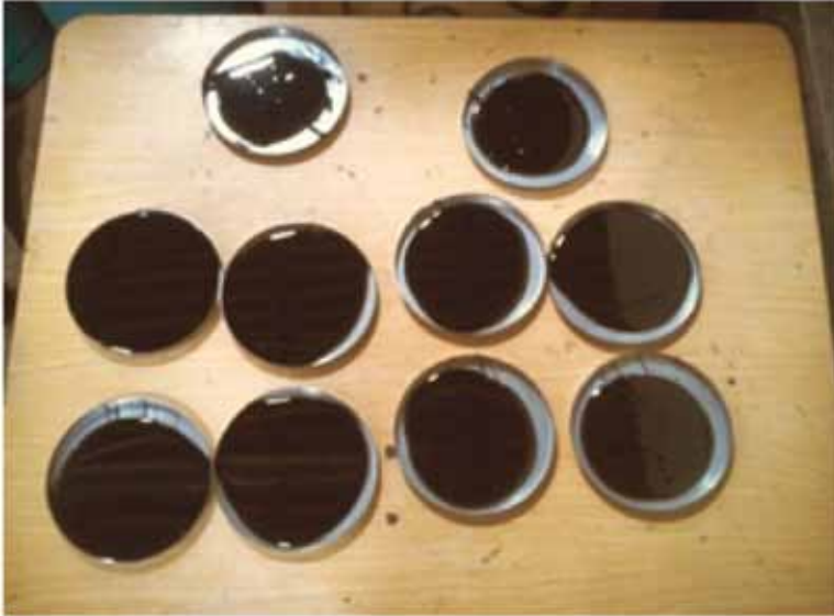
Figure 2. Asphalt trays