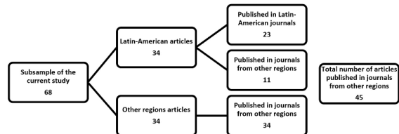
Figure 2 Description of the subsample of evaluated articles regarding their data collecting area and journal origin

The 115 articles where the full text was not evaluated arise from the fact that they are in a language other than Portuguese, English and Spanish, or it was not possible to obtain the full text on any of the bibliographic exchange system. Only the articles that did not have full or partial overlap of the sample were included. The concordance rate among the reviewers was