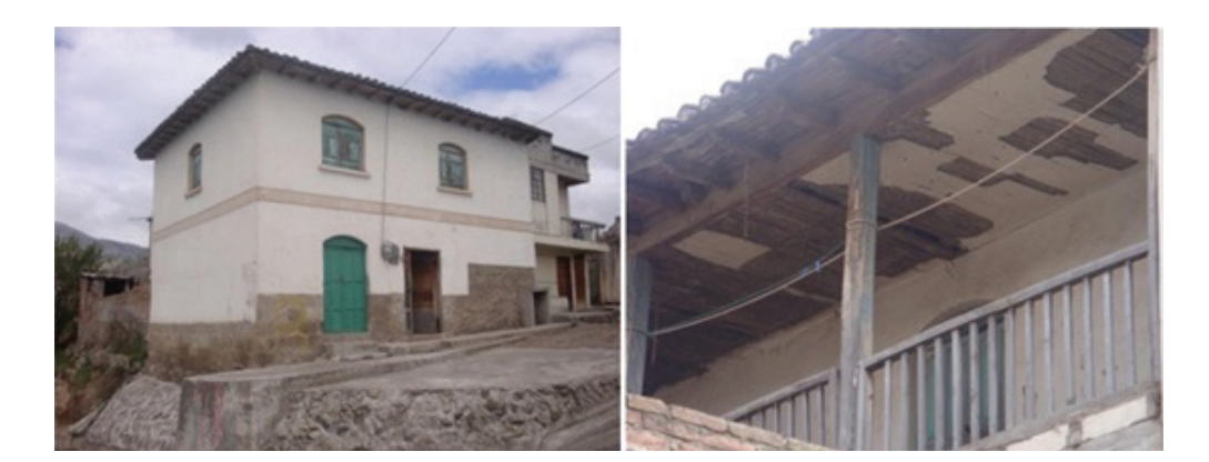
Figure 1. Home with 35% deterioration, of the XX century in Riobamba city.

was conceived as a "pastiche" of elements without hierarchy that comes from different places and of different kinds. This was a period of confusion, lethargy and immobility in relation to the environment proper to a crisis. Also, transmission and transformation of the architecture of the Built Heritage is a topic oriented to investigate how this change manifests itself and what is the scope of the energy transmission and the Transformation of the project of architecture.