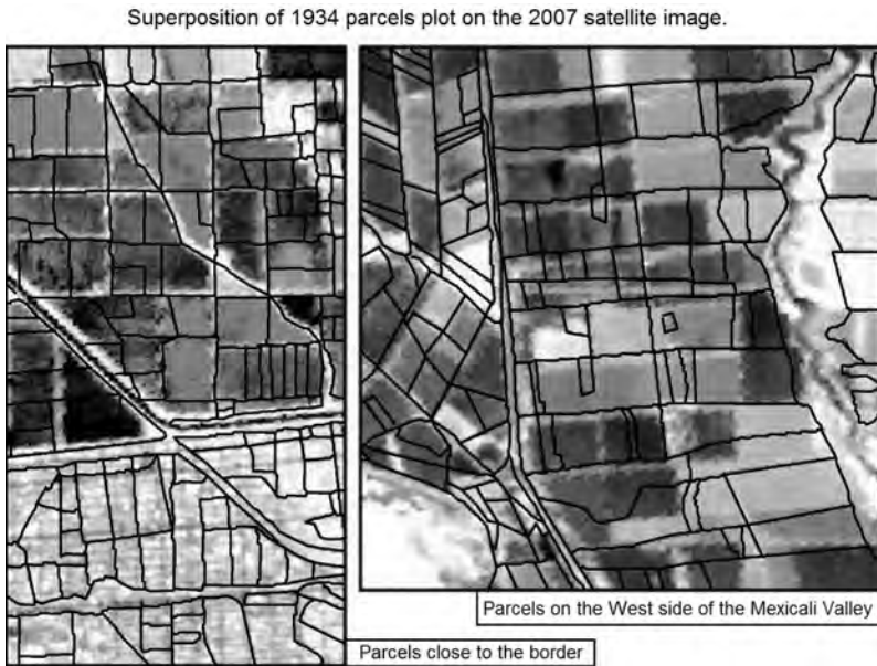
Figure 3: Changes in Border Agricultural Divided Parcels (1934–2007)

Figure 3 shows that both neighboring valleys have changed their morphological structure since the period prior to the Cárdenas reform. In the Imperial Valley, the changes show a clear tendency toward grouping of parcels within the original layouts. In the Mexicali Valley, a timid and dual tendency is seen toward the grouping and partition of some new layouts. Contrary to what is generally admitted, the morphological structure prior to the 1930s in both neighboring valleys does not correspond to what is