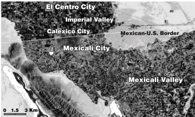
Figure 1: Structural units of the landscape South of the Colorado River Delta

Despite its pertinent and pedagogical aspects, the satellite imagery of the lower Colorado delta that has circled the world as an illustration of the border's contrasts has also generated countless speculations that search for a rational explanation for a complex landscape gap 1 ; a gap in the anthropic front in an arid and desert environment; a gap in the agricultural sector contrasting the urban sector; and, finally, a border gap between two entities with different values and identities (see Figure 1). What might seem to be a boring case of déjà vu in other latitudes takes on a sensational aspect in this region with the location of the border between a developing country and the most affluent country in the world. Within this context, all arguments are valid: from the stereotypes derived from the positive connotation regarding the solid and orthogonal agrarian morphology juxtaposed with another that is arrogant and anarchical, to the more elaborate and ideological, but not very convincing, contents. Could the recorded landscape terms aim to have an explanatory value in such conditions that provide few dimensions of the social relationship with space?