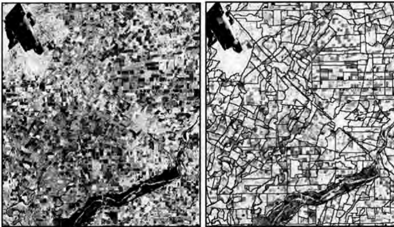
Figure 4: An example of structural difficulties for grouping of parcels