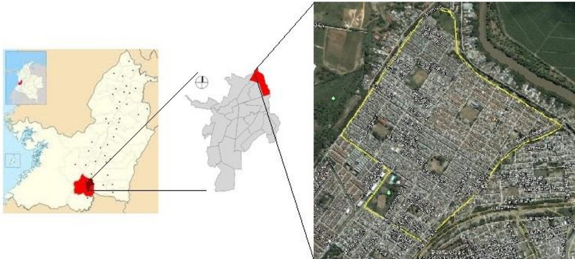
Figure 1. Location of the study area-Floralia neighborhood, northern Cali

The selection of storm drains was done by assigning a numerical value to each of them on a digital map of the area and allocating them at random, subject to a minimum separation of 70-90 m. Moreover, backup storm drains were identified in case, on visiting the selected location in the field, it did not exist or could not be included for other reasons. However, on one occasion, this backup protocol was not followed, and a replacement drain was selected by convenience, after finding the selected one to be completely sealed. Once identified in the field, the selected storm drains were identified and marked.