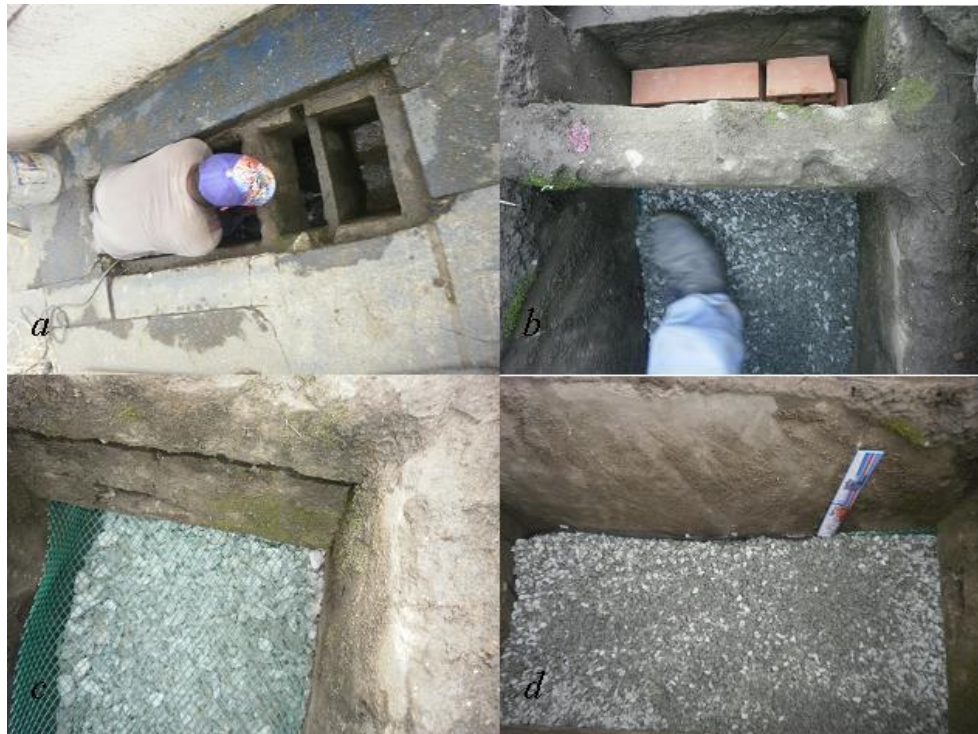
Figure 2. Storm drain modification process. (a) Screen perforation, (b) Installation of brick and gravel 9.5 mm diameter (3/4"), (c) Installation of the diamond mesh d. Modified storm drain

Before performing the physical modification of the 21 storm drains, all 42 selected storm drains were completely cleaned, removing floating solids (e. g., dry leaves, sticks, and solid waste), supernatant water, and accumulated sludge. The drains were then pressure-washed to remove excess grime and any eggs of A. aegypti or other insects adhering to the walls.