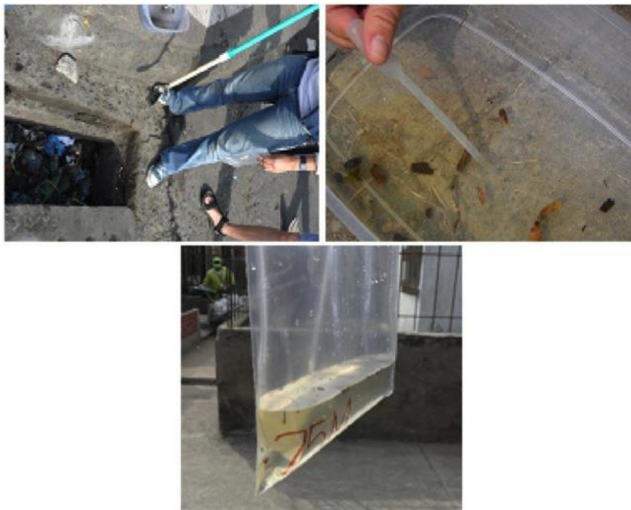
Figure 3. Collection of larvae and pupae from the evaluated storm drains

Entomological inspections were performed using a larval dipper with a volume of 70 cm 3 . Ten samples were extracted from each drain with water, for a total of 700 cm 3 /storm drain. Each sample was poured into a plastic tray to facilitate the identification of any mosquito larval stages. A plastic dropper was used to transfer them to Ziploc ® plastic bags containing 200 cm 3 of 70 % ethyl alcohol. These bags were sealed and labelled with the date and number of the storm drain evaluated (figure 3).