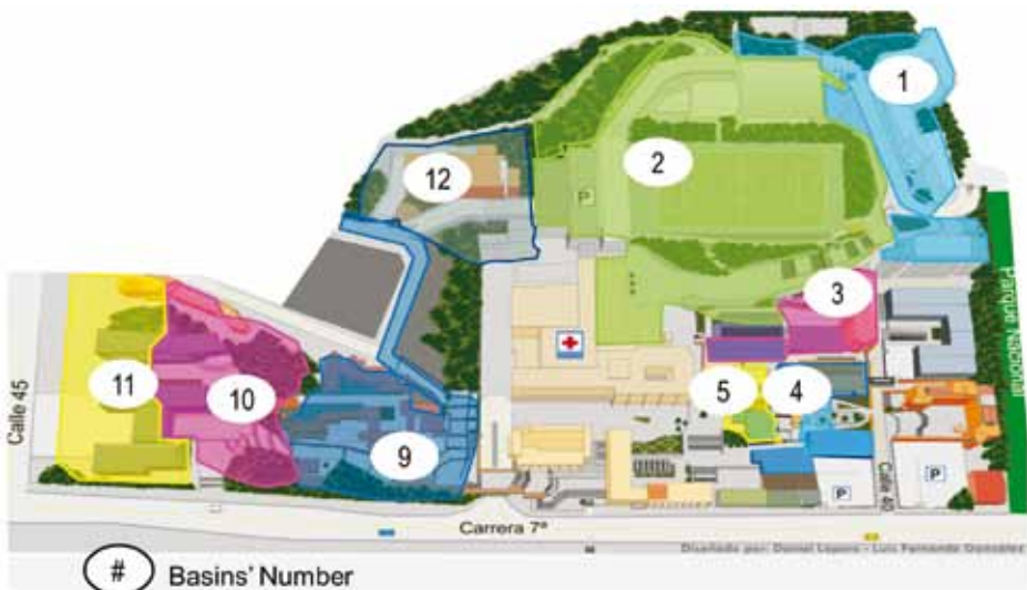
Figure 3. PUJB campus basins defined for scenario 5

Taking into account the results described above, the execution phase of the PUJB RWH began. This was carried out with a participatory work between the PRO of the University, university researchers and an expert designer, in the making of the engineering design for scenario number five. First, the location of the RWH system was chosen and also the treatment option to meet the requirements for non-potable uses. The criteria take into account for this decision was: (i) The quality of the stormwater (according to the quality campaigns heavy metals were found in the parking building –sample point 4– see Table 2) and (ii) the location of the existing stormwater drainage system. The chosen place is near to sample points four and five (figure 1). In this place it was projected the collection of stormwater runoff from the parking building (3,776 m 2 ), the soccer field, and the areas that surround it (14,816 m 2 ).