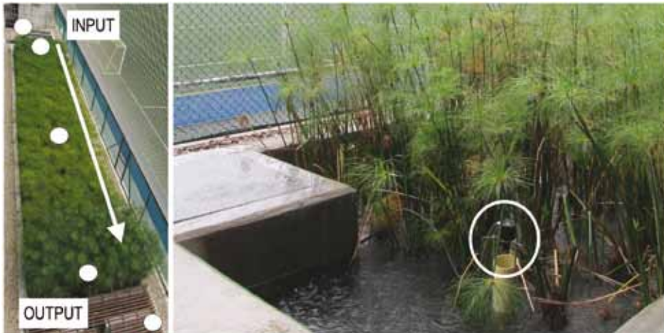
Figure 4. Constructed-wetland/reservoir-tank system (reservoir-tank volume = \pm 145 m 3 ; superficial area of the wetland = 85.12 m 2 ) and ultrasonic-level measuring device (white dots)

To gauge the performance of the system (its hydraulic attenuation), it is monitored by means of two triangular sharp-crested weirs, a series of piezometers, and ultrasonic level sensors. The locations of the weirs are: the entrance of settling tank (Input Figure 4 left) and the exit of the constructed-wetland (Output Figure 4 left). The piezometers are spaced throughout the constructed-wetland. For the ultrasonic levels, two were placed in front of each weir, three in the constructed-wetland, and one in the reservoir tank (White dots Figure 4 left).