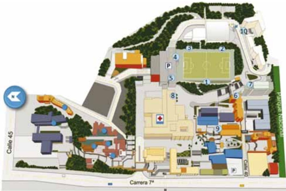
Figure 1. Location of the ten sample points in the PUJB University

(i) Water quantity and quality and (ii) location and proximity to potential rainwater collection centers. The results of the raw stormwater analysis were compared to the limits set out by the Food and Agriculture Organization of the United Nations (FAO) [49], EPA [50], and standards from Colombia [51] and Japan [52]. The standards are for non-potable uses: landscape irrigation, environmental, and recreational uses. For each sample point, the runoff water quality for three storm events was assessed through 25 analytical tests used to quantify physical properties and chemical constituents.