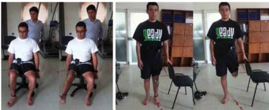
Figure 1. Open and simple kinematic chain (siting and standing)

The Figure 1 depicts an example of two physical tests regarding the sitting and standing position.