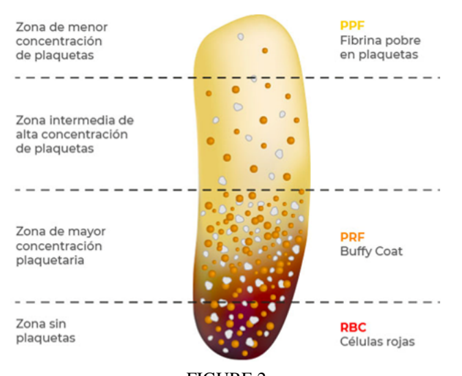
FIGURE 2 Structural Characteristics and Distribution of PRF Components Figure adapted by the authors (29,33,36,44)

The histological analysis performed by Gutiérrez, et al. (44) showed that there is no homogeneous platelet distribution throughout the FRP membrane. In the upper part, which is called platelet poor fibrin (PPF), there is a lower platelet concentration than in the lower BC (white blood cell layer) area. In the RBC, layers of polymorphonuclear cells and erythrocytes are observed. Regarding fibrin, it is homogeneous in most of the FRP, except in the upper zone that is a bit loose. In the same study, scanning electron microscopy (SEM) analyses confirmed that the structure of the fibrin network and the cellular content are different in the three zones of the membrane, the concentration of platelets is higher in zone BC, and it is diminished in the PPF zone. Likewise, fibrin in zone BC is denser (29,33,36,44).