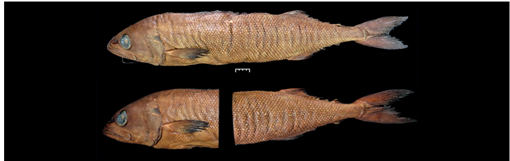
Fig. 2. Ruvettus pretiosus collected in the continental Colombian Caribbean (October 21/2009).

The specimen was analysed at the facilities of the Universidad de Bogotá Jorge Tadeo Lozano, Santa Marta campus. Biometrics (meristic and morphometric data) were collected following Nakamura & Parin (2002). The specimen was fixed in 4 % formalin, preserved in 70 % alcohol, and introduced into the Colombian Marine Natural History Museum at the Marine and Coastal Research Institute INVEMAR (INV-PEC9011), Fish collection ( Figure 2 ).