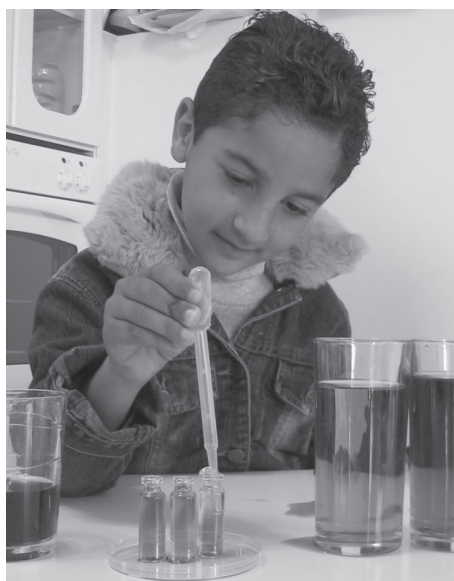
Figure 2. (a) extracted from reference reference 14, (b) the child conducting the same experiment as in (a) in the kitchen. The child on the right playing the role of the lab person as the rabbit in the story.