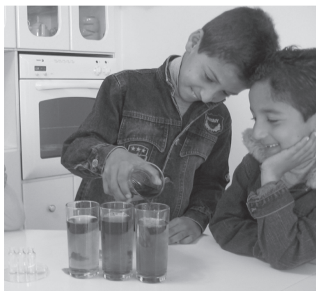
Figure 1. (a) extracted from reference 14, (b) pupils conducting the same experiment as in (a) in the kitchen. The child on the left playing the role of the teacher as the rooster in the story.