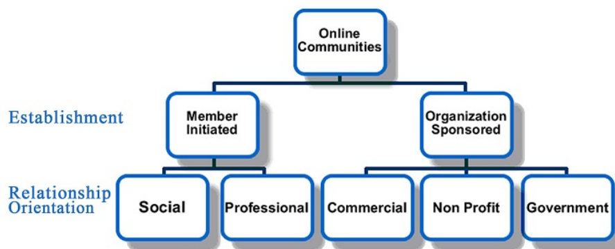
FIGURE 1 Porter's typology of Virtual Communities

Porter's typology of VCs (figure 1) is a classification system for multi-disciplinary research on VCs which uses establishment type and relationship orientation as categorization variables (Porter, 2004). This typology was chosen for the case selection because its categorization is exhaustive and applicable on the empirical level. From a theoretical viewpoint the focus was on a 'social', a 'professional', a 'non-profit' and a 'commercial' VC, but from a practical viewpoint VCs were also selected because they were mainly composed by members located in Rome. 'Government' VCs were not taken into account because they were not widespread at that time.