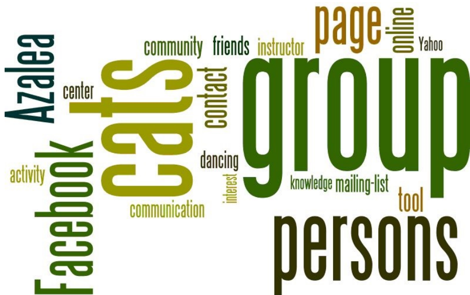
FIGURE 3 VC definition graphically represented ('cleaned')

Words like 'Azalea', 'Facebook' or 'mailing-list' refer to the online platform used by the respondent. Utilizing the most frequently used words and basing on a thematic analysis a user's definition has been obtained as follows: